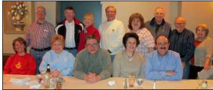
Pizza party attended by members

In early March, our club members gathered together for a second pizza party, this time at a restaurant located in Des Plaines. Spouses were also included at what is becoming a fun and welcome social event.