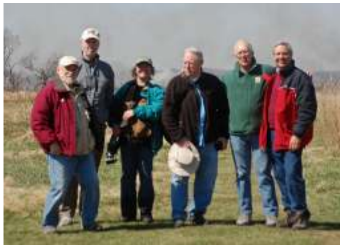
Club Members on Pelican Shoot

At the end of March, several club members traveled out to Batavia, Illinois to photograph white pelicans. This photo op was spontaneous, with word going out through our exclusive members' only email listing.